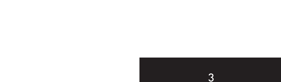
AFR 27 OCT 2005